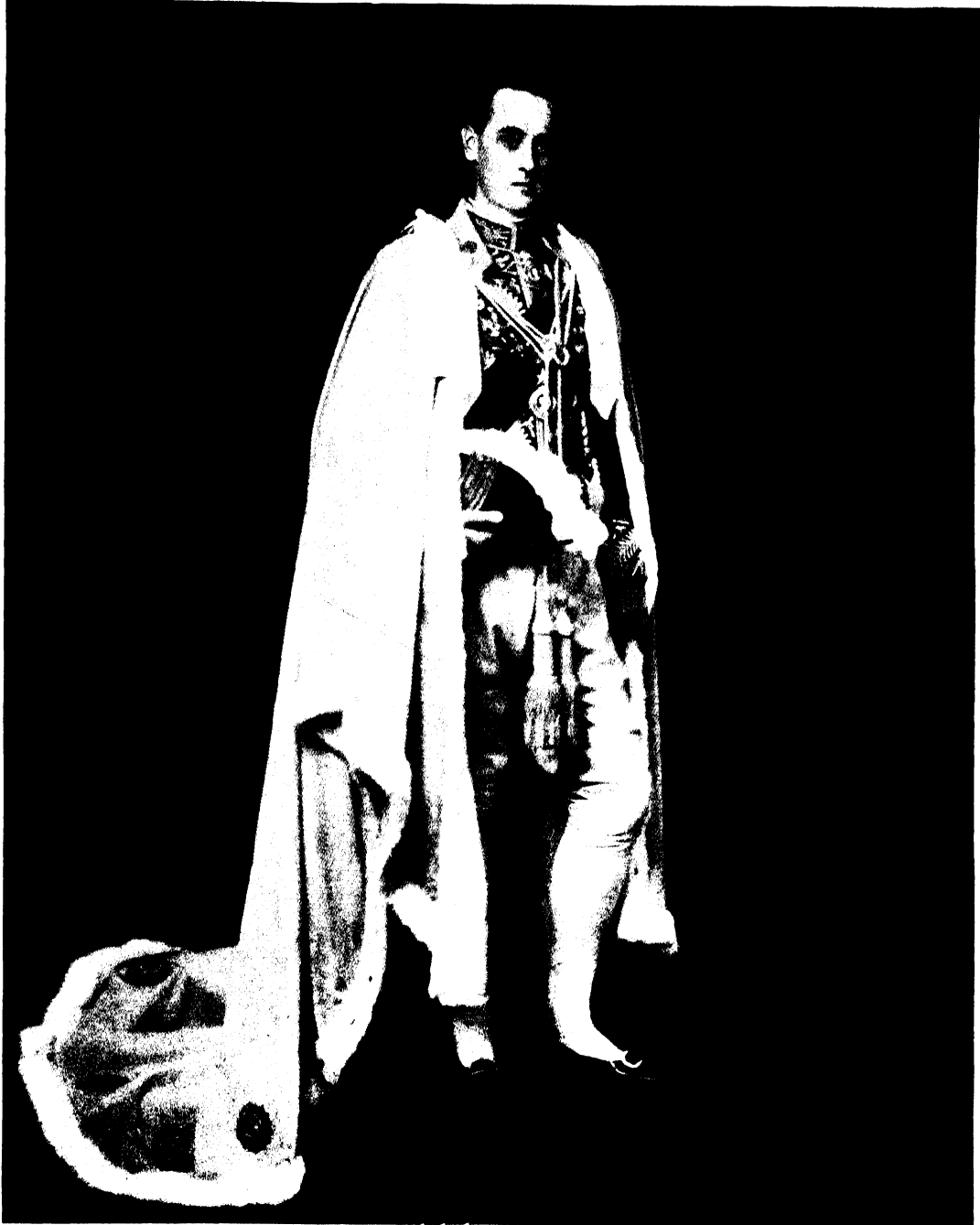
HIS EXCELLENCY THE MOST HONOURABLE THE MARQUESS OF LINLITHGOW, P.C., K.T., G.M.S.I., G.M.I.E., O.B.E., D.L., T.D., VICEROY AND GOVERNOR-GENERAL OF INDIA.